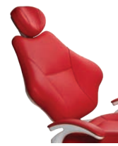
Single Layer Cushion