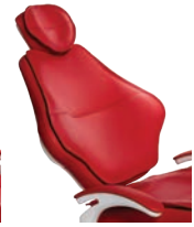
Double Layer Cushion